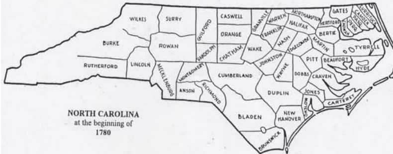
NORTH CAROLINA at the beginning of 1780