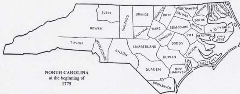
NORTH CAROLINA at the beginning of 1775