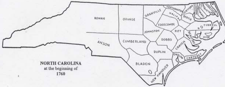
NORTH CAROLINA at the beginning of 1760