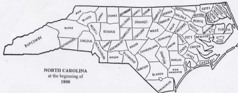
NORTH CAROLINA at the beginning of 1800